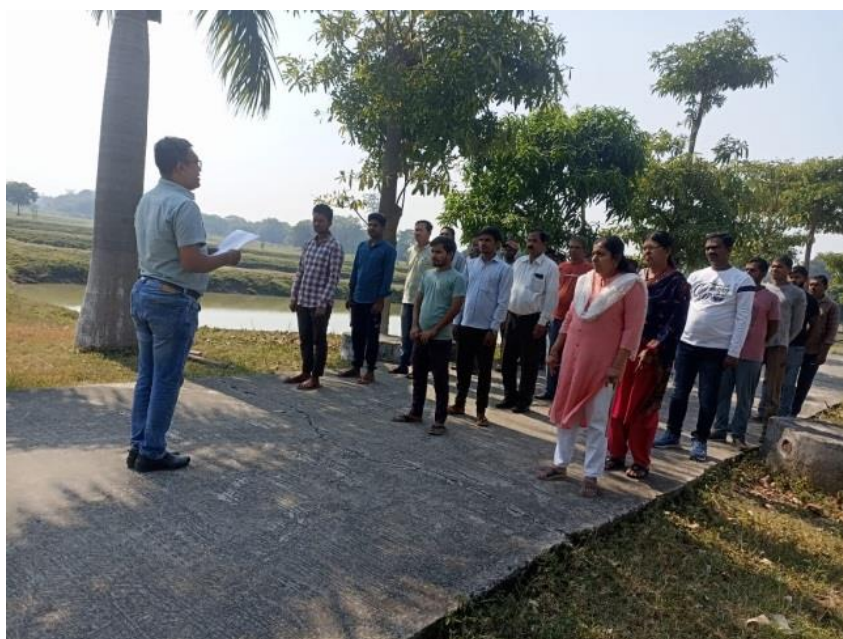
Officials and staff of ICAR-CIFE, Powarkheda Centre taking the Integrity Pledge