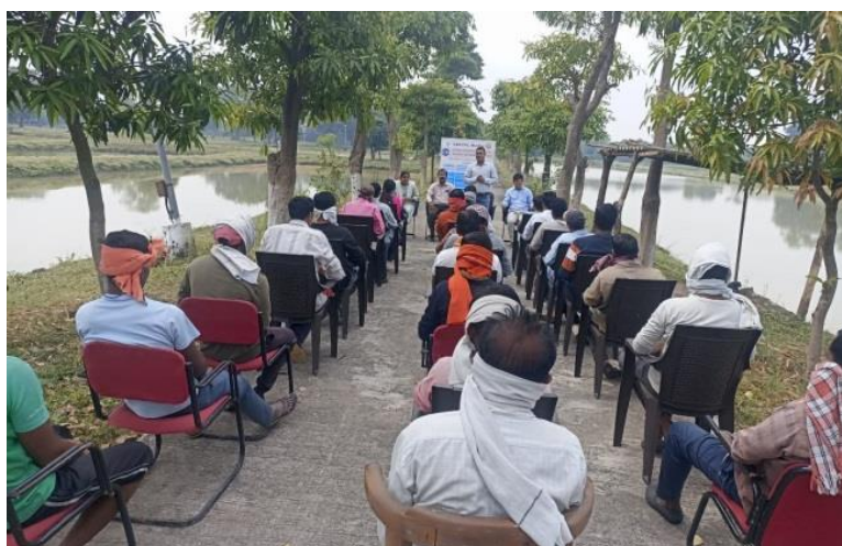
Interaction Meeting with staff, students, and farmers