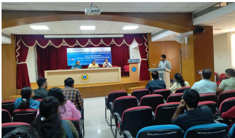
A view of on-going Debate Competition for students

c. Is vigilance mechanism effective in India? d. Is education important in building a vigilant society?