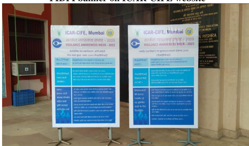
PIDPI awareness posters displayed at the Main Building’s reception area