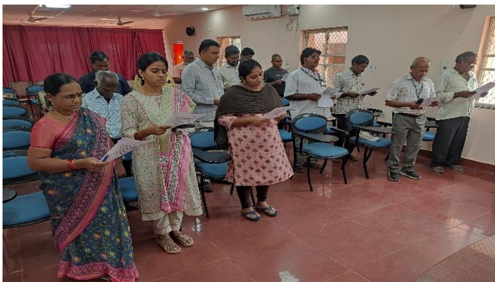
Integrity Pledge Ceremony at BWFF, Kakinada Regional Centre