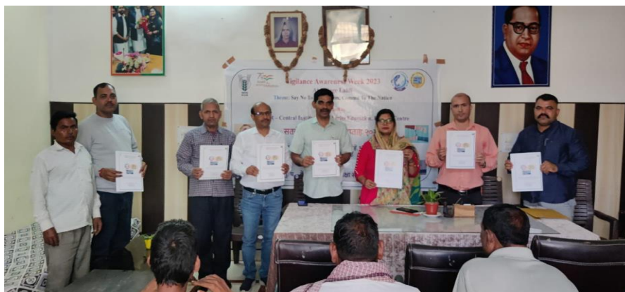
A view of Gram Sabha on PIDPI Awareness

A Gram Sabha for vigilance awareness was organised at the Gram Panchayat office, Lahli. The Sarpanch of the Gram Panchayat, official, staffs of ICAR-CIFE, Rohtak Centre and a group of 30 numbers of villagers participated in the program. The participants were made aware about the importance of keeping highest standards of honesty and integrity for the benefit and progress of the country. The pamphlets relevant to the given theme were distributed to all the participants. The staffs and villagers deliberated on various topics with regard to finding out the root cause of corruption, to bring an end to corruption by raising voice against it and by adopting preventive vigilance measures.