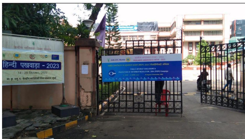
PIDPI banner displayed at the Main Gate