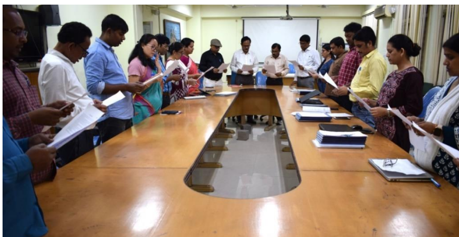
Officials and staff of ICAR-CIFE, Kolkata Centre taking the Integrity Pledge