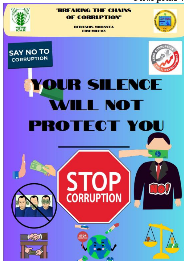
Second prize winning poster