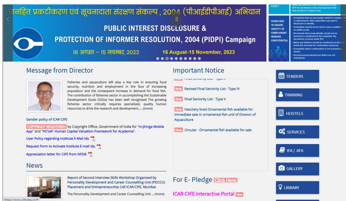
PIDPI banner on ICAR-CIFE website

Banners on ‘Public Interest Disclosure & Protection of Informer Resolution, 2004’ (PIDPI) were displayed in different languages such as Hindi, Marathi and English, in front of Main Gate and at the Office Building in the campuses at Yari Road and Seven Bungalows. PIDPI Banners were also displayed at the Office Main Gate of Brackishwater Fish Farm, Kakinada, Freshwater Fish Farm, Balabhadrapuram of ICAR-CIFE, Kakinada Centre and ICAR-CIFE Kolkata Centre. PIDPI posters were also displayed at Powarkheda, Rohtak, and Motipur Centres of CIFE.