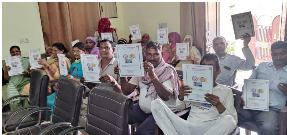
Interaction Meeting with Farmers on Vigilance Awareness