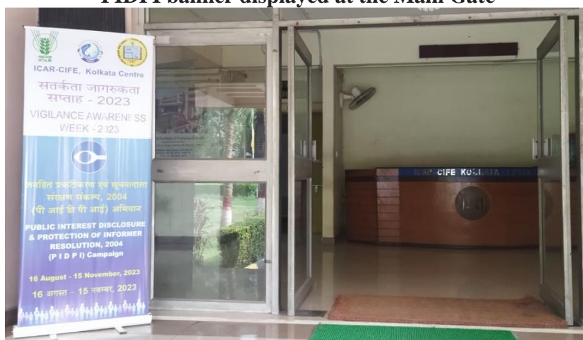
PIDPI poster displayed at CIFE, Kolkata Centre