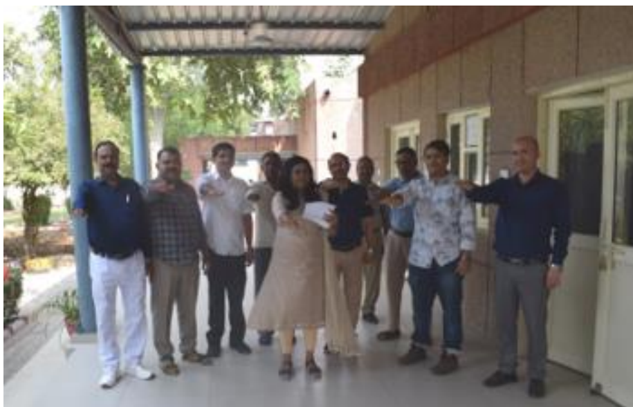
Officials and staff of ICAR-CIFE, Rohtak Centre taking the Integrity Pledge