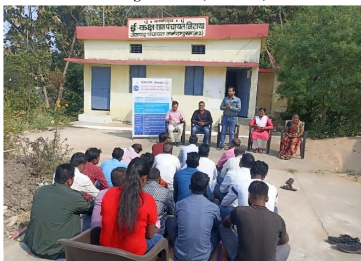
A view of Gram Sabha at Nitaya Panchayat, Narmadapuram (M.P.)