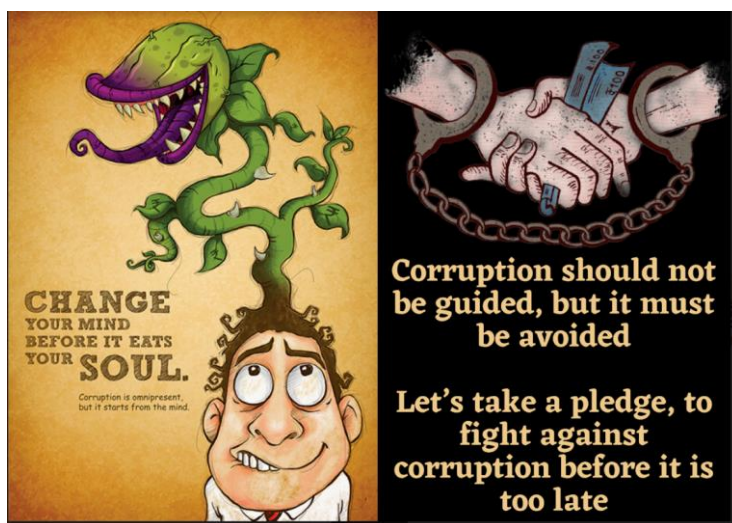
First prize winning poster

A poster competition was organized for students on 31 st October 2023 on the topic were 'Say No to Corruption: भ्रष्टाचार का विरोध करे'. A total of 11 students participated in this competition the prize winning poster are shown below-