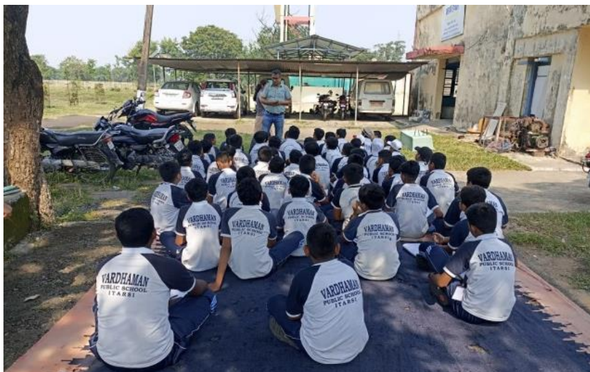
Vigilance Awareness Campaign and Interaction Meet with students of Vardhaman Public School, Itarsi, Narmadapuram (M.P.)