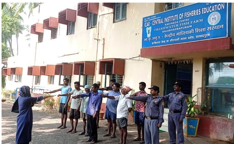
Integrity Pledge taken at FWFF, Balabhadrapuram of Kakinada Regional Centre