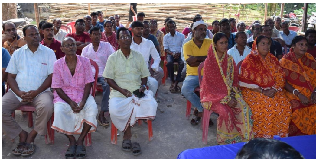
Interaction between scientists and farmers in a Gram Sabha